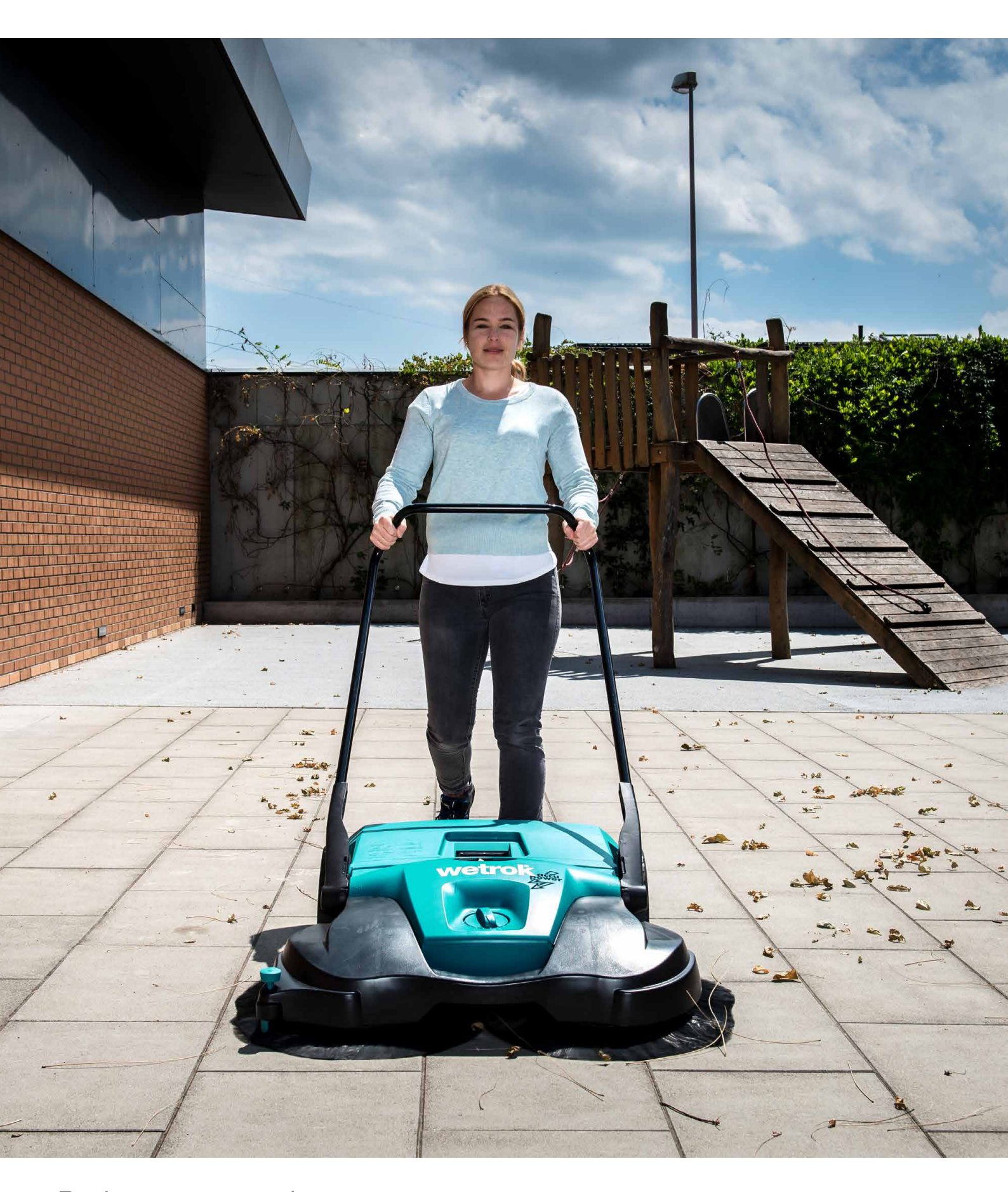
Push sweepers and vacuum sweepers Clean surfaces whatever the weather