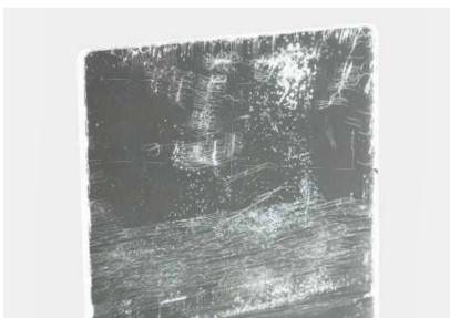
Acrylic glass pane treated with conventional glass cleaner or alcohol-based cleaner Stress cracks develop, which reduce the lifetime of the pane.