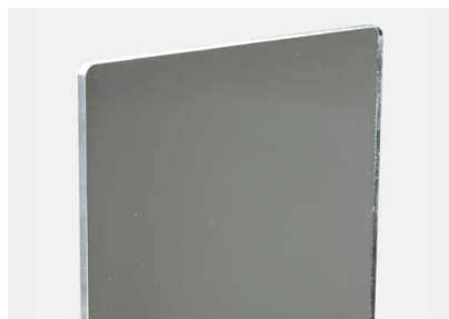
Acrylic glass pane treated with Acrylstar The pane remains in optimal condition.