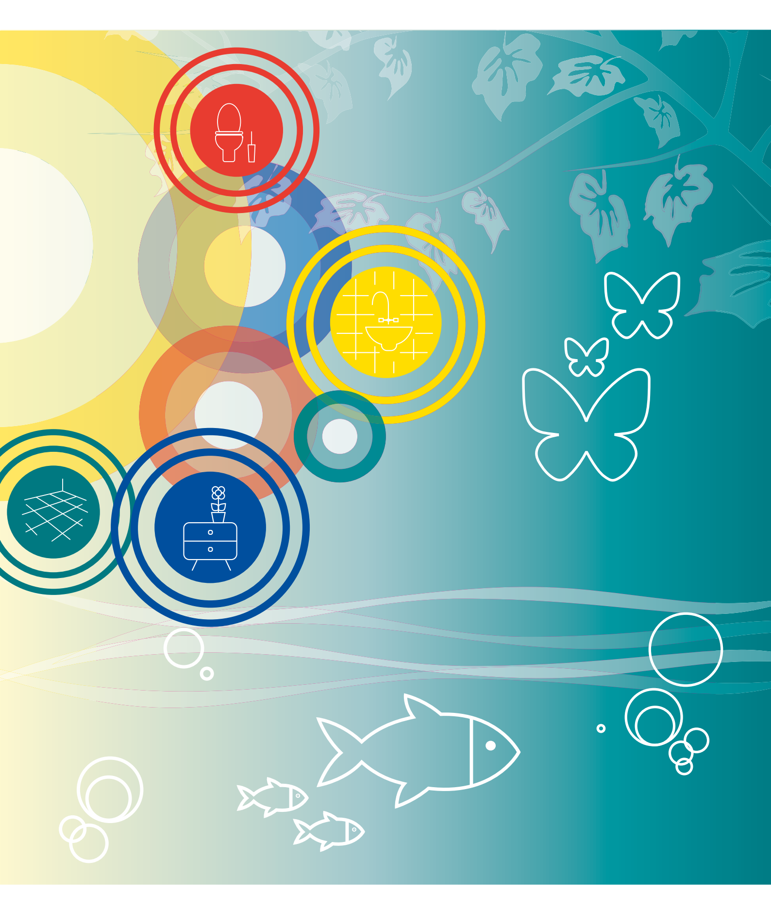
Wetrok EcoLine For clean buildings and clean water